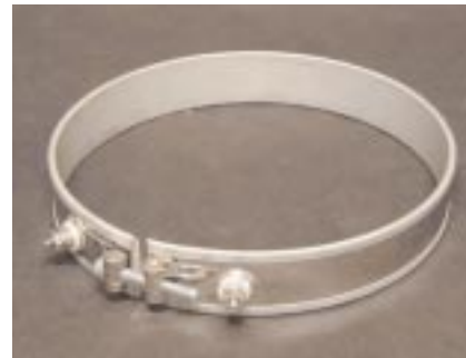
3671K14 1200 Watt oil tank heater for 9" OD-