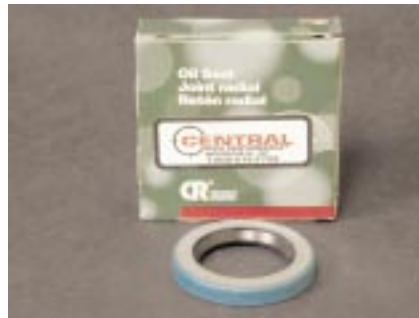
11734 Idle arm seal.