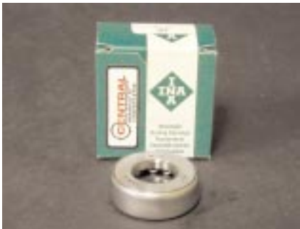
D-7 Idle arm/Centerlink bearing.