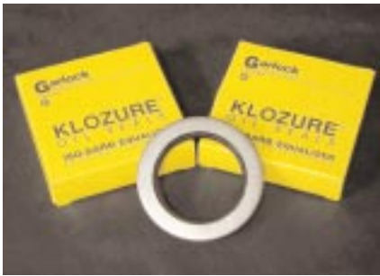
63X1822 Garlock front hub seal.