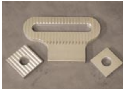
3310 Track bar mount, trailing arm.