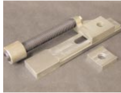
3340 Single rail standard track bar adjuster.