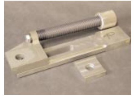
3350 Single rail road course track bar adjuster.