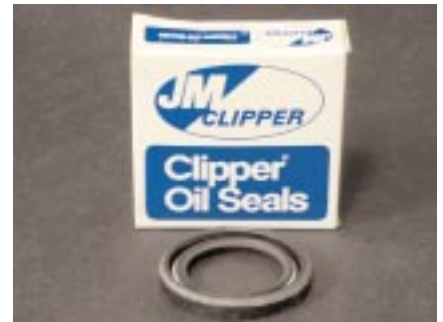
8820 Outer axle seal for cambered rear end.