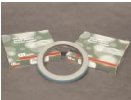
25043 CR Front hub seal.