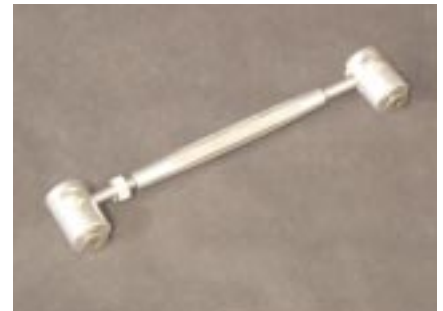
RCM-004 Adjustable spoiler support 4".