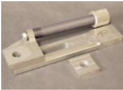
3550 Adjustable shock mount.