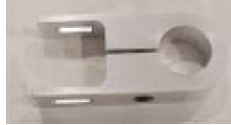
404 Aluminum steering column mount

Adjustable mount slides up or down on steering column.