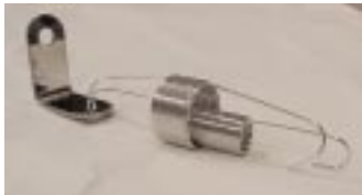
1405 Throttle return spring kit Stainless steel.