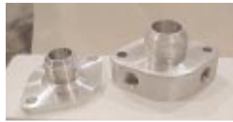
824 #16 Male billet aluminum thermostat housing

With oilite bushings to prevent galling. (Sold in pairs.)