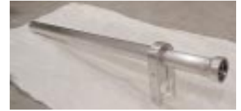
403 Aluminum steering column

Adjustable mount slides up or down on steering column.