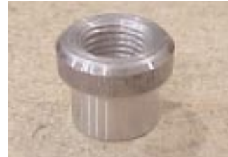
18 1/8" aluminum female pipe weld boss