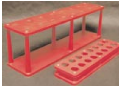
910 Plastic lifter tray 911 Plastic valve tray