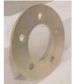
750 1/16" Steel wheel spacer Fits 5x5 hubs with 5/8" studs.