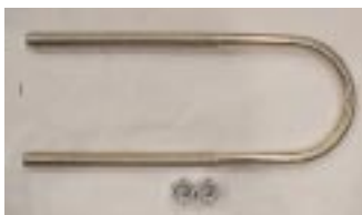
710 Steel U-bolt Measures 3" x 10", with 4" of threads. Fits all 3" axle tubes.