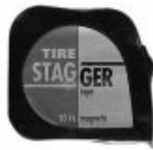
744 Tire stagger tape 10' X 1/4".