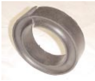
52544 Single groove 1" thick spring rubber spacer