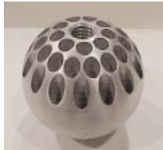
740 3/8"-16 Lightweight billet aluminum shifter ball