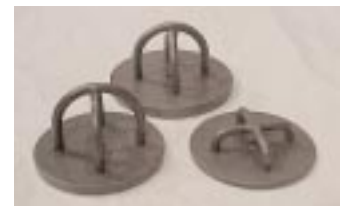
423 5-1/2" Front upper aluminum spring retainer