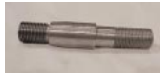
P-001 Penske/Carrera tapered shock pin

Machined from 6061-T6 aluminum. Accepts the 7/16"-20 shifter ball.