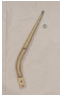
739 Lightweight billet aluminum shifter stick

Helps prevent fire and heat from entering the driver compartment.