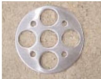
1410 Lightweight stainless steel scuff plate for 3/8" hood pin.