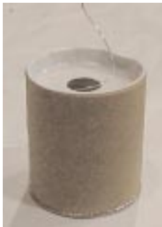
D003 .32 gauge stainless steel wire in a 1lb. spool.