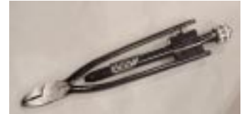
745 6" Safety wire pliers w/self returning handle

Accommodates 3/16", 1/4", 5/16", 3/8", 7/16", 1/2" and 5/8" diameter bolts. Includes two case hardened threaded bushings and two 1/16" cobalt steel high-speed bits.