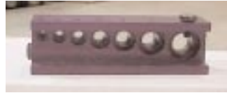
749 Safety wire drilling fixture

Accommodates 3/16", 1/4", 5/16", 3/8", 7/16", 1/2" and 5/8" diameter bolts. Includes two case hardened threaded bushings and two 1/16" cobalt steel high-speed bits.