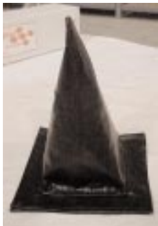
738 Mylar shifter boot

Helps prevent fire and heat from entering the driver compartment.