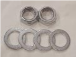
703 3/4"-16 thin nyloc a-arm nut