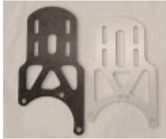
400 Lightweight billet aluminum rear end pump mount for 9" Ford, left side